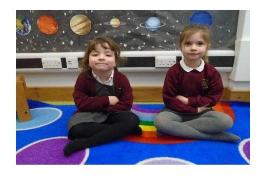
We are the Reception representatives.

Here are your school councillors for 2020. They are always available to help out if you need it. Please keep up to date with what we are doing by looking at our display board in school outside the Main Hall.